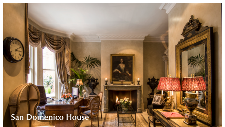
San Domenico House