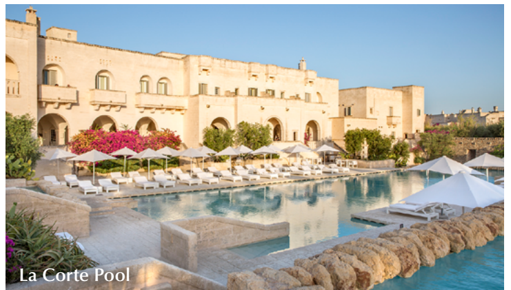
La Corte Pool