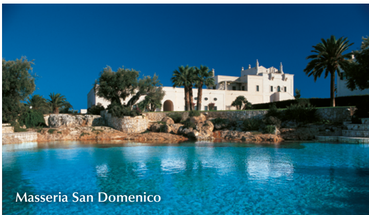
Masseria San Domenico

From May 2010 Borgo Egnazia is the largest property of the San Domenico Hotels Group , which includes Masseria San Domenico, Masseria Cimino, Masseria Le Carrube, San Domenico Golf, all located in Puglia, and San Domenico House in London. Each structure has an absolutely fascinating identity, made unique by the highest levels of hospitality.