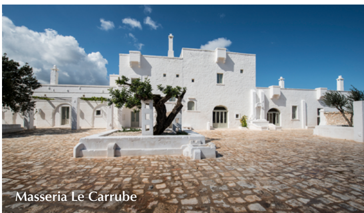
Masseria Le Carrube