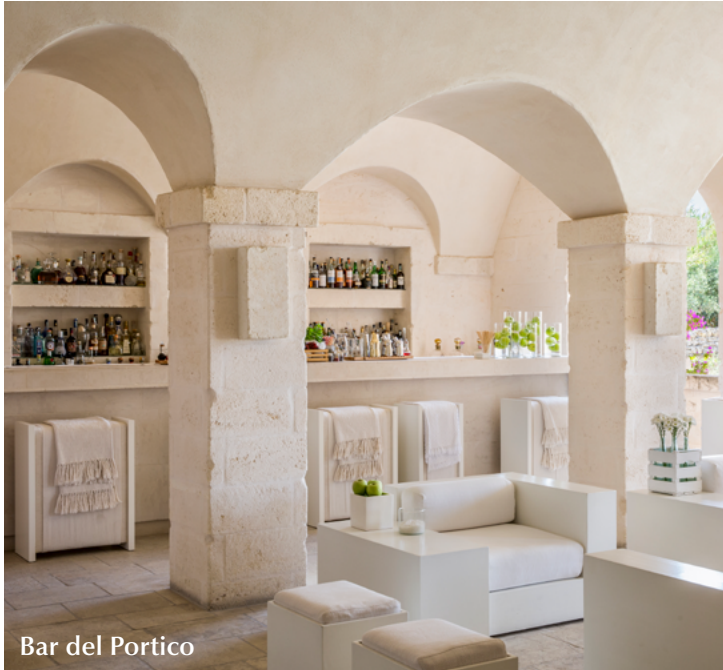
Bar del Portico